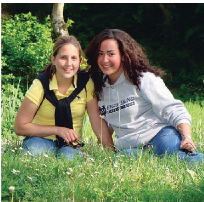
Parc in La Rochelle by Isabella Obediente

The school will enthrall you with its visionary architecture and its ideal location near the coast. The futuristic concept is continued inside the school with its 18 large, bright and friendly classrooms, a lecture room, a Learning Centre, Wi-Fi and two sun decks overlooking a private lake.