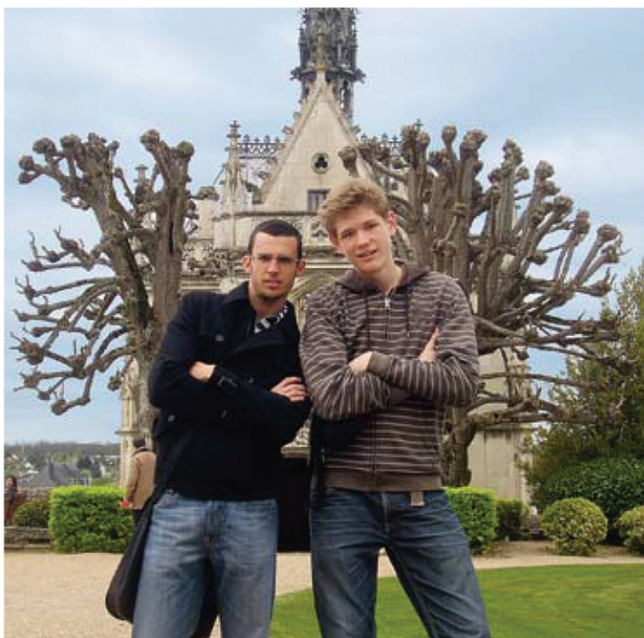
Château Amboise by Philipp Vehrenberg

The school is right in the centre of Amboise, only five minutes away from the shopping area with its small shops, street cafés and bistros. The school has seven classrooms, a Learning Centre with video room, a computer room, Wi-Fi, a library and on the ground floor a student lounge with a dining and reading area and a piano.